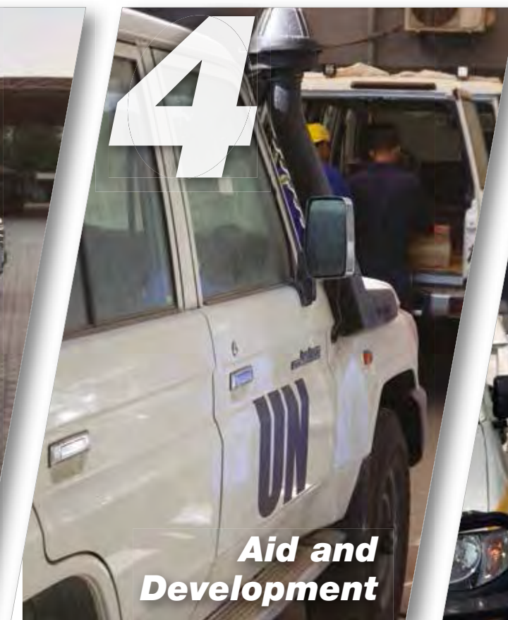
Aid and Development