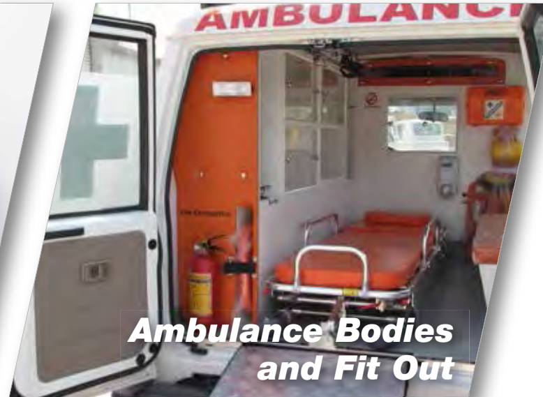
Ambulance Bodies and Fit Out

Ironman 4x4 auto body and custom auto paint technicians use top of the line paints and finishes.