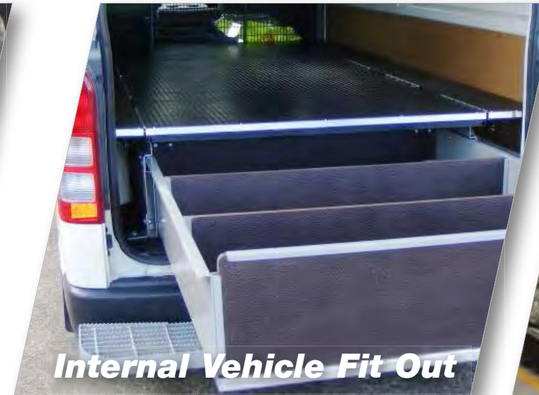
Internal Vehicle Fit Out

Ironman 4x4 Middle East can offer ambulance builds to suit most 4x4 vehicles or vans. Our ambulance upgrades are renowned for their off-road ability and reliability and can be built with support equipment.