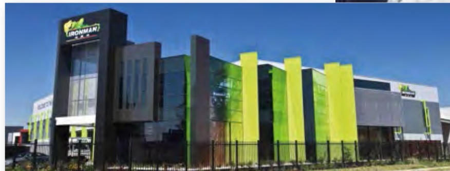
Head Office - Melbourne, Australia

A large fleet of more than 100 new vehicles allows for the continual development and engineering of products for the Australian and global 4x4 markets.