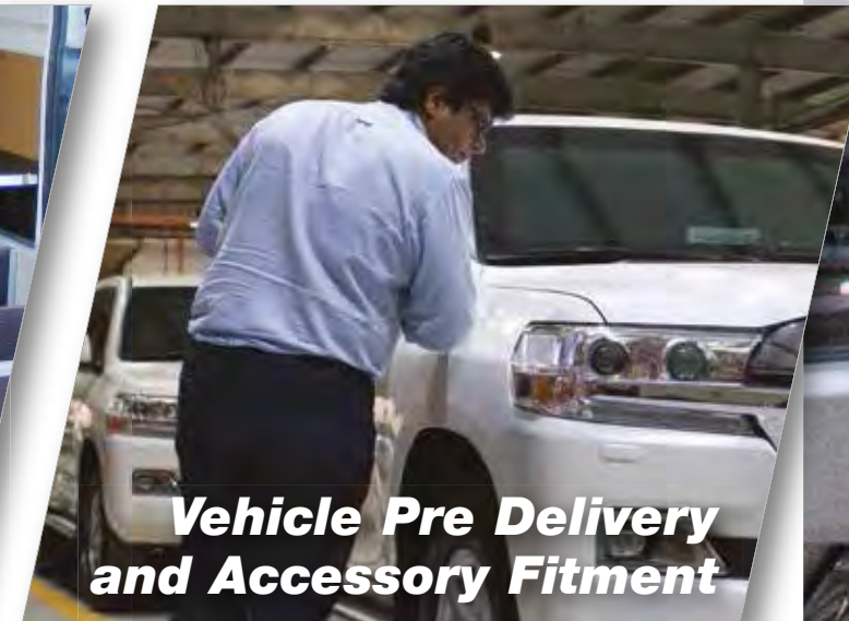
Vehicle Pre Delivery and Accessory Fitment

Our team can provide all types of storage solutions, including cargo barriers and drawer systems, cutting in windows and cargo false floors.