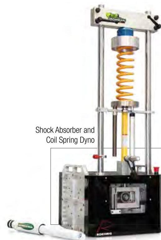
Shock Absorber and Coil Spring Dyno

Three ranges available - Nitro Gas, Foam Cell and Foam Cell Pro Soft or firm valving options to suit a wide range of driving styles Heavy duty twin tube construction