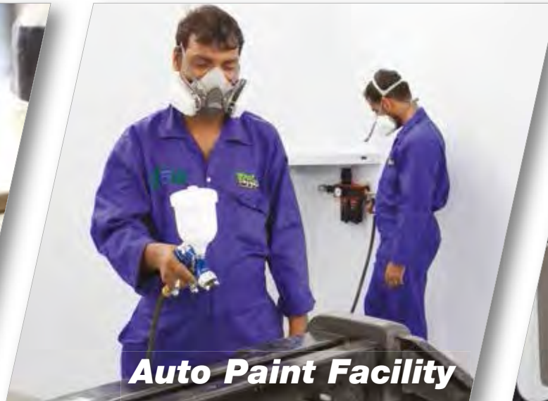
Auto Paint Facility

State of the art technology allows Ironman 4x4 to develop everything from underbody protection, replacement bumpers to complex roll-over systems.