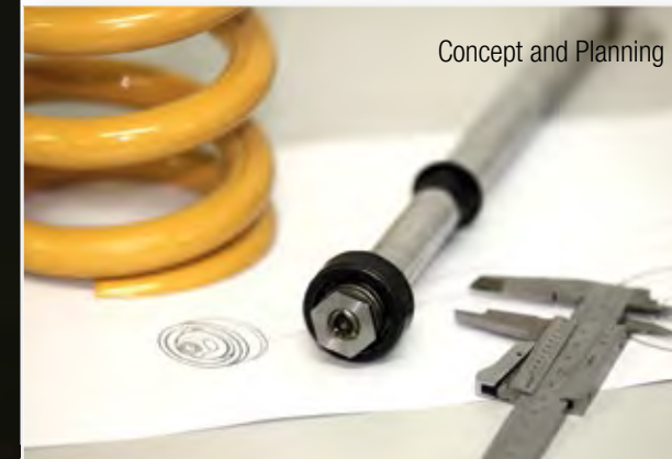
Concept and Planning