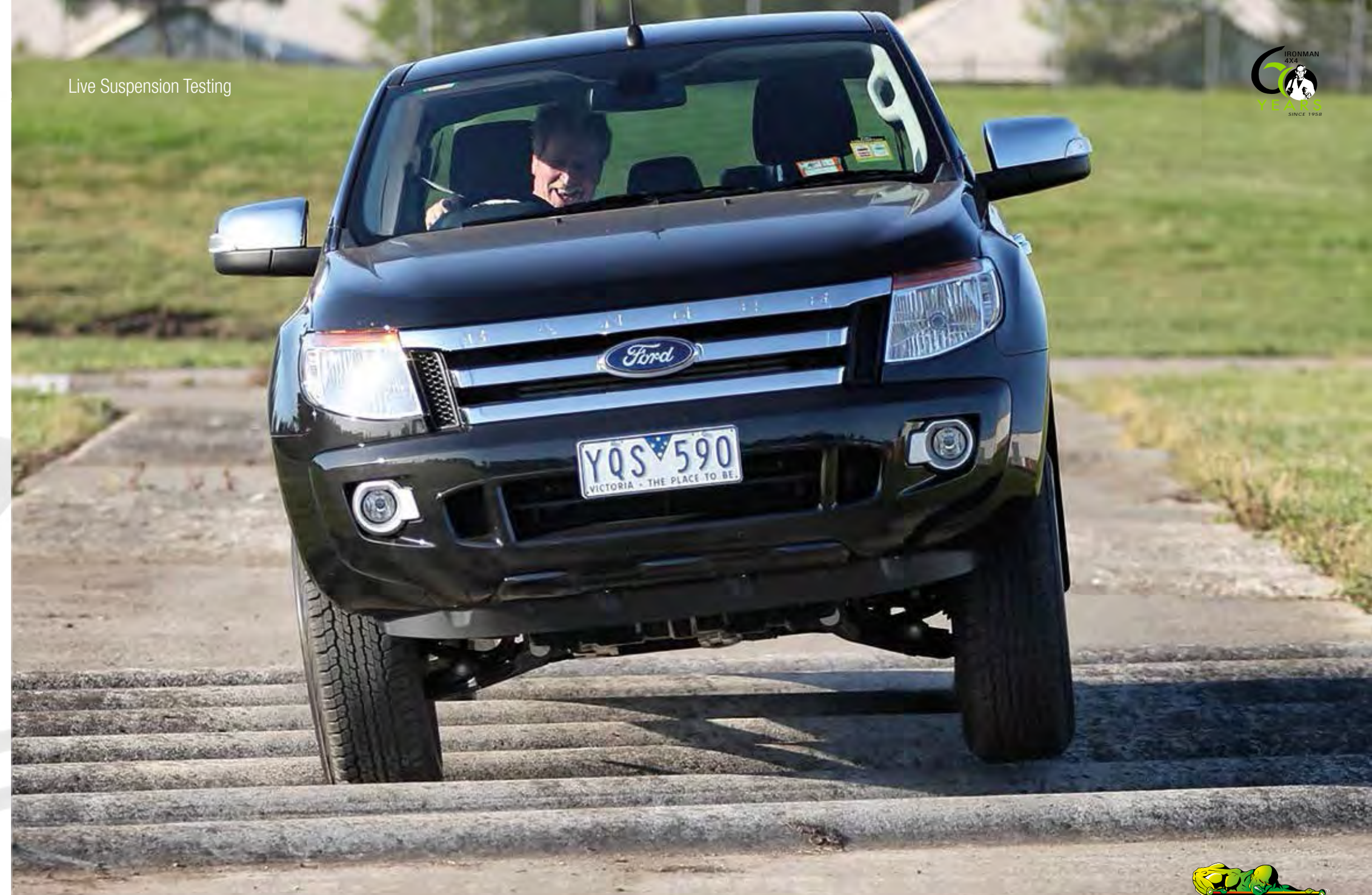
Live Suspension Testing

Thicker bar diameter than original to improve ride and handling Improving grain structure of steel to increase strength and durability Cold rolled splines to increase strength and durability